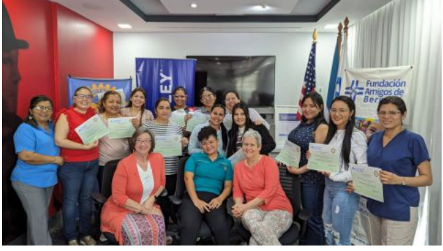
been given to enhance the practical experiences in each class.

There has also been equipment purchased with grant funds that will support the courses being held. Audiovisual equipment, including screens, projectors, computers and speakers, has been purchased and given to each of the larger Hospitals in San Pedro Sula, Honduras. Three simulation mannequins and two simulation heads (used to practice intubation) have